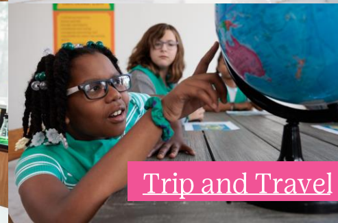
Trip and Travel