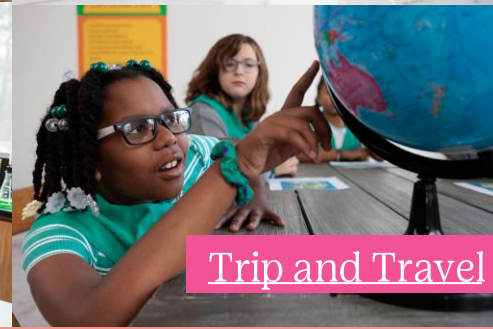
Trip and Travel