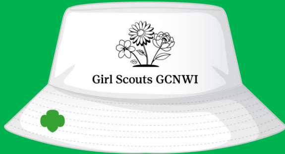
Commemorative Bucket hat