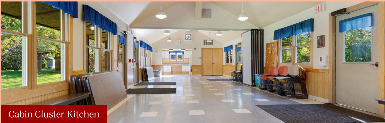
Cabin Cluster Kitchen