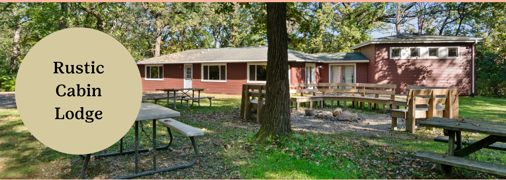
Rustic Cabin Lodge