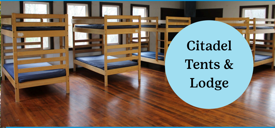
Citadel Tents & Lodge