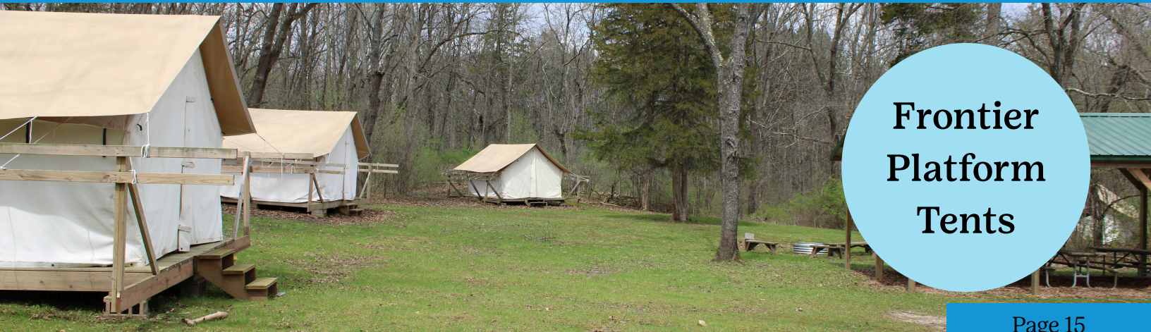
Frontier Platform Tents