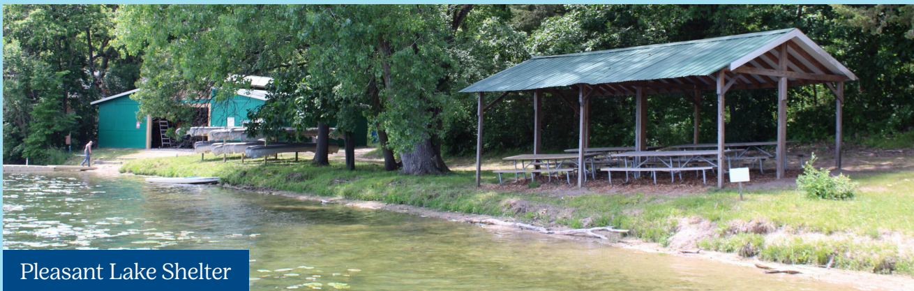
Pleasant Lake Shelter