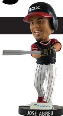
Jose Abreu Bobblehead available for first 20k fans